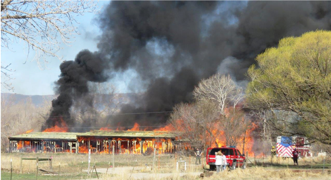
A fire south of Montrose Sunday afternoon destroyed vintage autos and other possessions shortly after 4:30 p.m. The blaze was started by a controlled burn that rekindled and blew onto neighboring property.